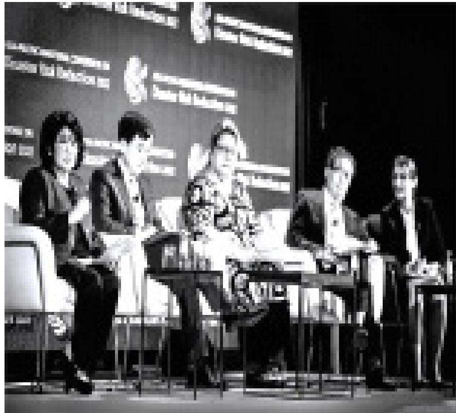
Secretary for Environment and Natural Resources Maria Antonia Yulo Loyzaga (leftmost) discussed the importance of strategic multistakeholder engagement to build the business case and scale up investment in disaster resilience at the APMCDRR plenary session on 20 September in Brisbane.